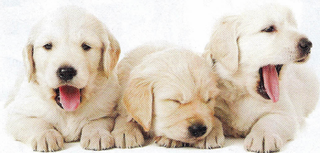
GOLDEN RETRIEVER PUPPIES

People often cite the benefits of neutering on dog behavior as another reason to neuter early, but studies show the effects of neutering on aggression varies so greatly among breeds that no generalization can be made at this time.